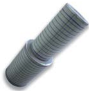
7. Hemipleat details on request