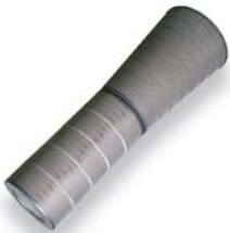
6. CamPulse EF