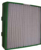
8. CamClose details on request

As part of our continuous improvement, Camfil Farr reserve the right to change specifications without notice.