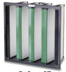
5. Cam GT